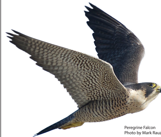
Peregrine Falcon